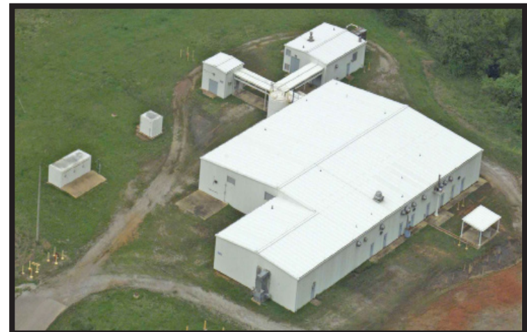
Laboratory. 16,100 SF/1,496 SQM in three buildings. Former NASA chemical laboratory, fully equipped with testing equipment. 10' ceiling clearance. Nitrogen and carbon dioxide gas systems.