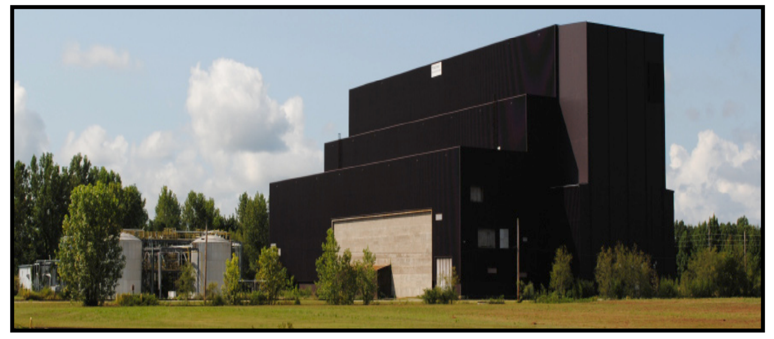
Turbine Building. The turbine building is 66,528 SF/6,181 SQM, has a 250 ton crane, and an eave height up to 90 feet/27 meters. The building has rail into the building.